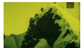
EIN HELDENKAMPF IN SCHNEE UND EIS AT 1917, P: Sascha-Film Source: Filmarchiv Austria

EFG - The European Film Gateway Georg Eckes (Projektkoordination) Tel +49 69 961 220 631 Fax +49 69 961 220 999 efg@deutsches-filminstitut.de www.project.efg1914.eu www.europeanfilmgateway.eu