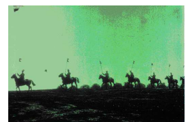
BELGIQUE MARTYRE BE 1919, R: Charles Tutelier