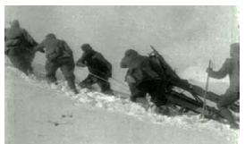
GUERRA SULLE ALPI IT 1916, R: Luca Comerio