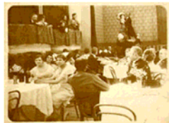
Title: Framestill from Az utolsó