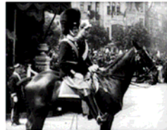
Title: Revue des troupes belges par S.M. le Roi Albert Director: unknown Date: 1914